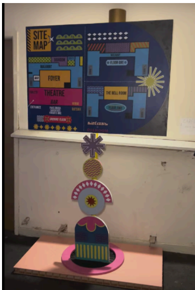
Festival Signage: Dialled In 2024